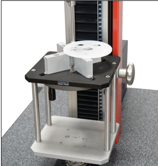
Test arrangement with universal mount, support fixture and compression die