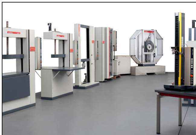
Our extensive selection of pre-owned testing machines and instruments